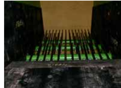
The picture shows the upper screening deck with Divergators/Bar Sizers